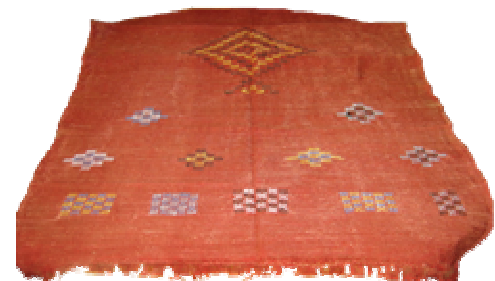
Reference C6 R1 Size 150 x 90 cm

We can also help you to find more flexible sizes and will match your specific inquiry with our local artisan for the hand woven rugs and with our suppliers for the traditional one depending on quantity.