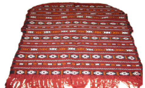
Reference C7 R1 Size 150 x 90 cm

Please refer to the relevant reference code and contact us for any inquiry “quotation, delivery, availability”