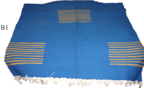
Reference C9 B1