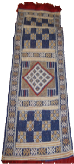
Reference C8 B1 Size 200 x 60 cm

For centuries the tribal people of Morocco's Atlas Mountains have passed down the delicate art of rug-weaving. In Northern Africa, rugs are not only a practical asset to the home; they are an integral part of the culture. Hand-knotted rugs are the preferred gift of people of high social rank, and are also a traditional wedding gift. These exquisite design features a traditional tribal pattern in Berber's mountains.