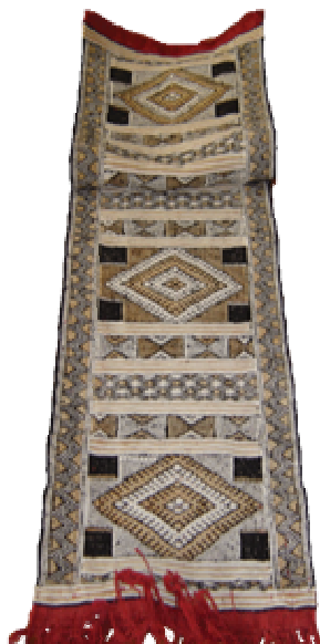
Reference C8 G2 Size 200 x 60 cm