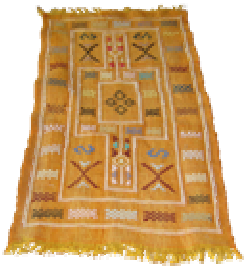
Reference C5 Y1