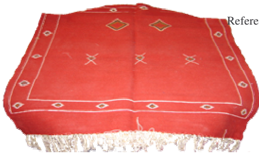
Reference C9 R1

Your opportunity to acquire the delights of Moroccan unique items without moving abroad Our sublime Moroccan rugs are unique pieces and the highest quality