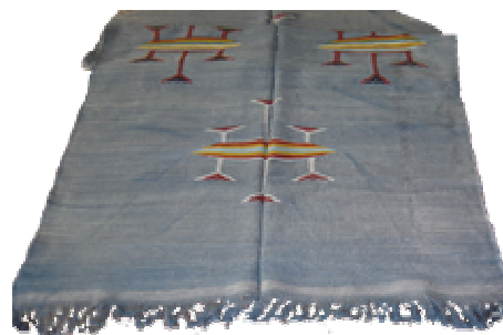
Reference C6 B1 Size 150 x 90 cm