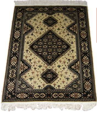
Reference C3 Size 110 x 70 cm

Find the creations of the Moroccan artisans, A perfect addition to any room as a floor covering or wall hanging. A unique creative gift idea.