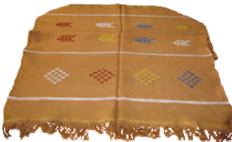
Reference C6 Y1 Size 150 x 90 cm

We are in the process of assembling a collection of unique hand woven rugs and are proud to offer you this collection.