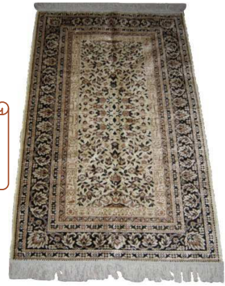
Reference C2 Size 140 x 70 cm