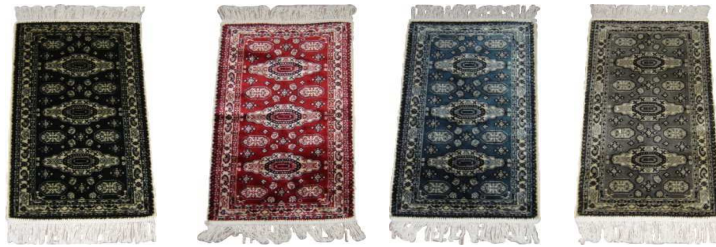
Reference C1 Size 70 x 30 cm Available in 5 colours: Blue - Green - Grey - Red - Pink

Unique design and authentic Moroccan style. Adapt to any room as a floor covering. Exclusivity of the small size Ref. C1 in the market.