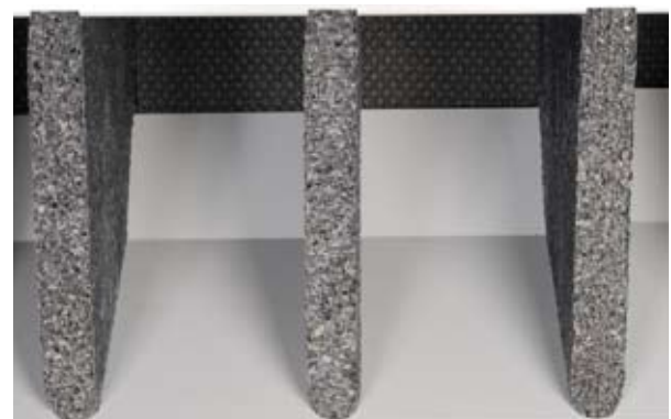
Noise reducing construction with high absorbent insulation