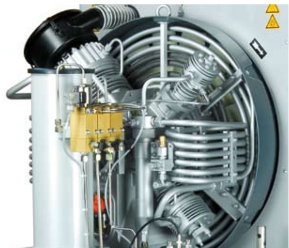
4-stage high pressure compressor block K150