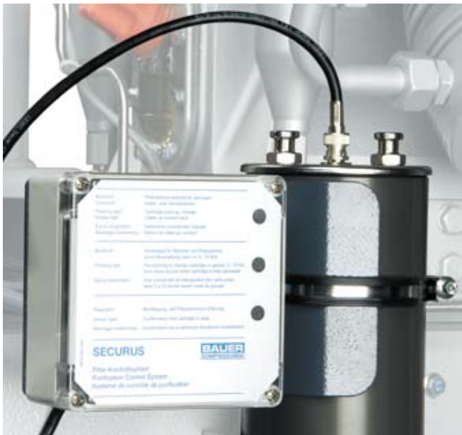
P-Filter system with SECURUS filter monitoring