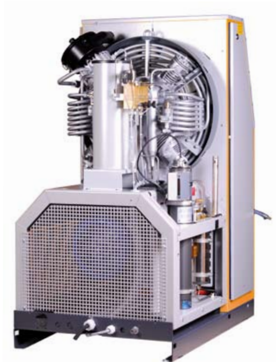
PE VE 500 in open unit construction

* ( +/- 2 dB(A), measured at the distance of 1 meter )