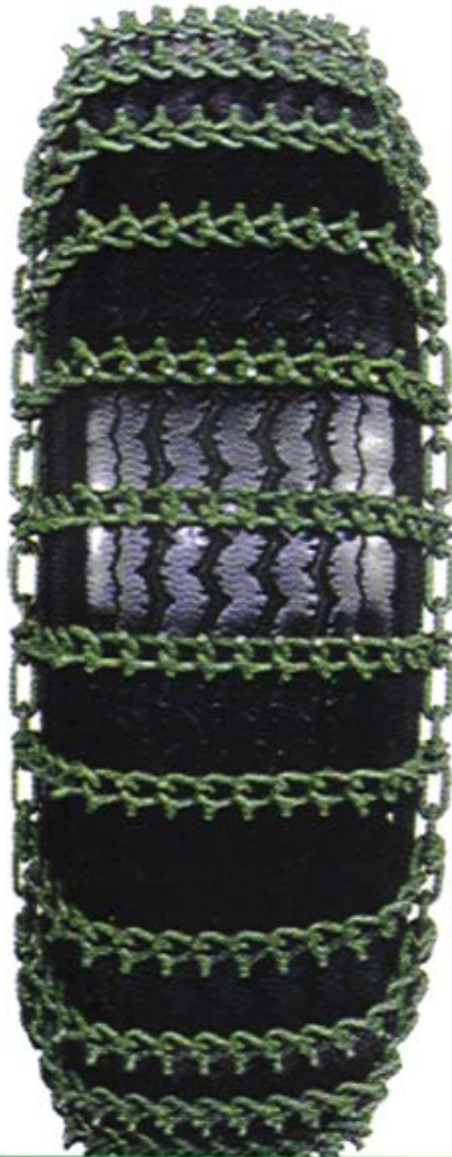
OFA LST +