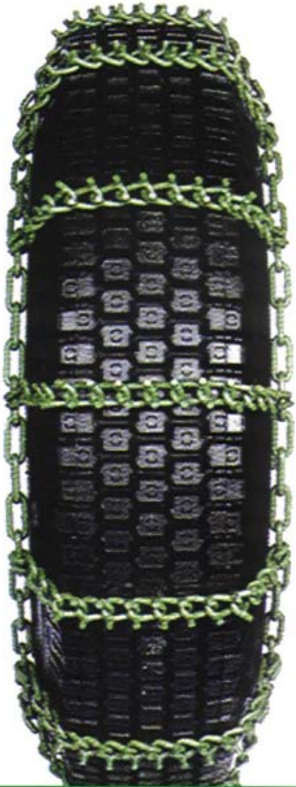
OFA LS +