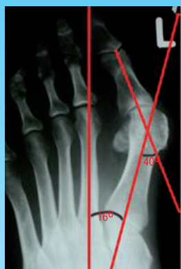
Hallux Valgus without Hallufix®-splint Intermetatarsal angle: 16° Hallux Valgus angle: 40°

for painful bunions and deformity of the big toe